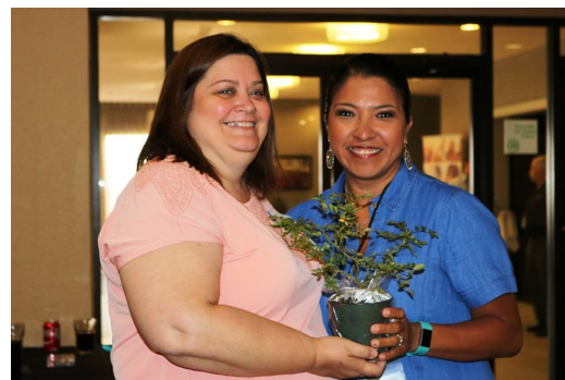
Tyler TX is known as the Rose Capital of the World and the Tyler Chamber of Commerce donated several rose bushes to be given away as door prizes at the 2017 Conference.

This newsletter brought to you by your publications committee.