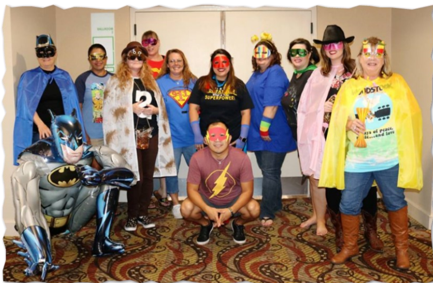
The theme at the Presidents Reception was Super-Hero's and some of our members dressed the part.